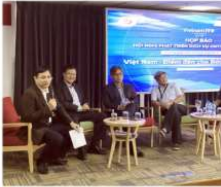
A press conference was held in HCM City on August 27 introduce the Vietnam ITO conference 2019, which will at the Tân Sơn Nhất Saigon Hotel from October 23 to 26.